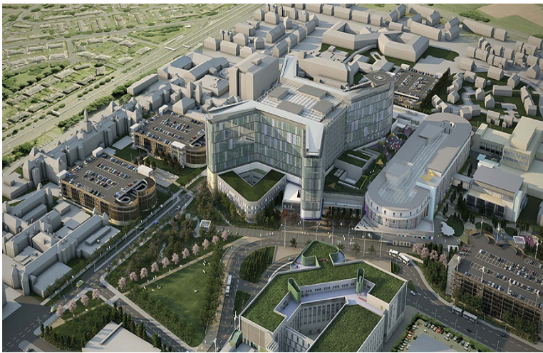
Southern General Hospital, Glasgow

Approximately one hundred and eighty thousand metres of Prysmian FP PLUS is currently being installed to connect in excess of sixteen thousand devices such as call points and smoke detectors in the campus.