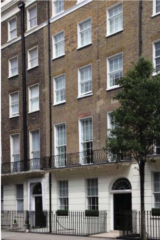
66 Great Cumberland Place exterior

Prysmian's FP200 Gold® and Afumex LSX with Earthshield have been specified for the fire alarm and power systems in a succession of grade 2 listed buildings in Marylebone, Westminster for the Portman Estate. The most recent development to benefit is 66 Great Cumberland Place which started on site in December 2010 and is due for completion in September 2011.